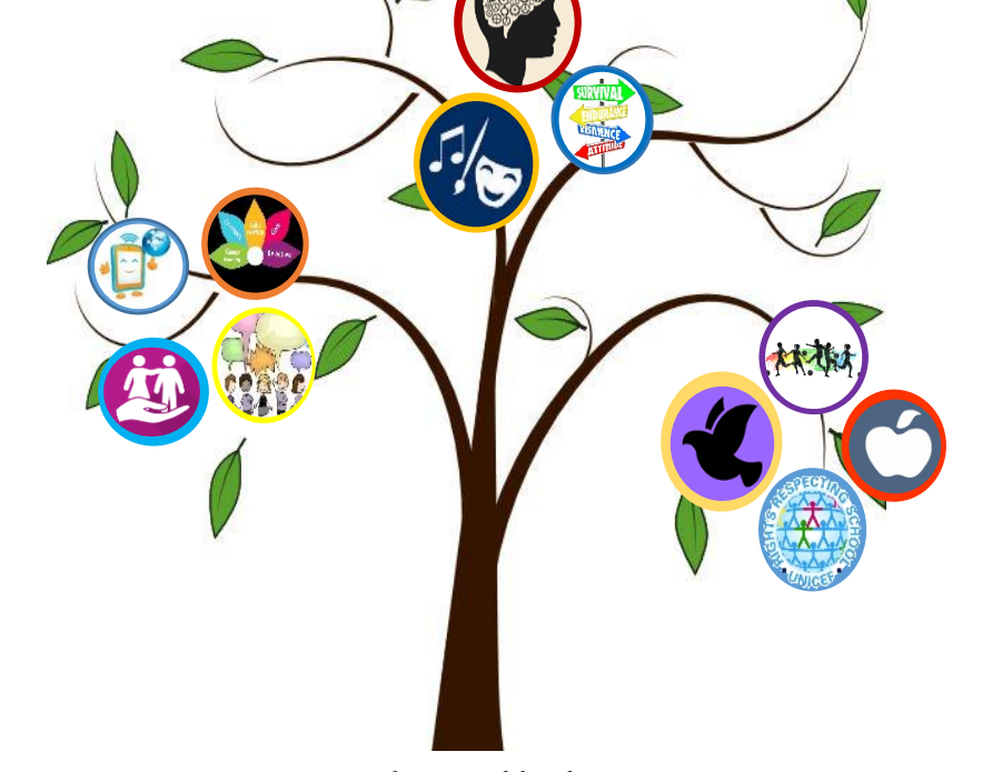
Ready, Respectful, Safe