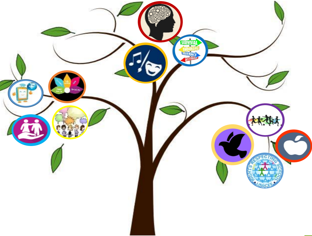
Ready, Respectful, Safe