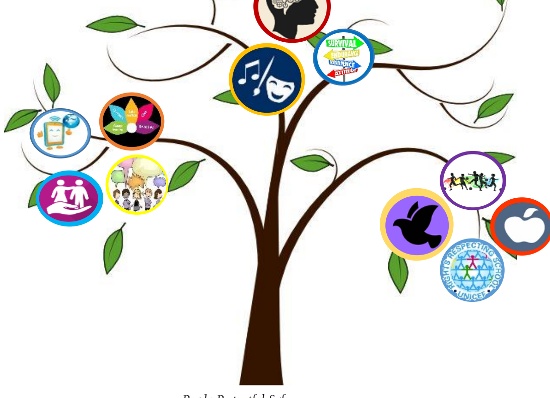
Ready, Respectful, Safe