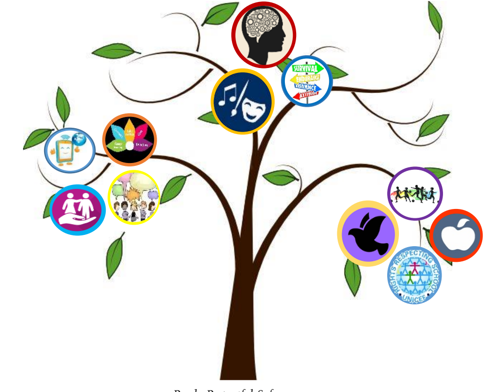
Ready, Respectful, Safe

Children in Need Anti Bullving Christmas Celebrations