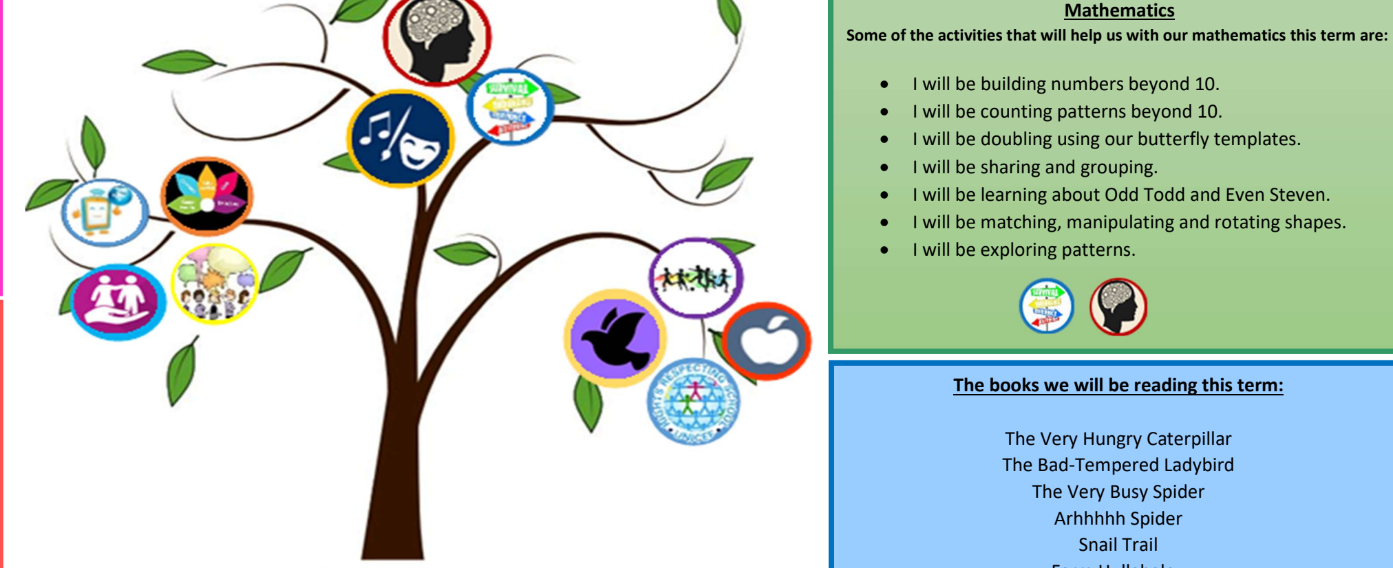
Ready, Respectful, Safe